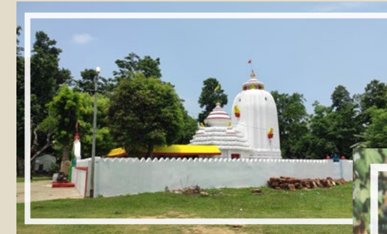
Swapneswar Temple, your immediate neighbour